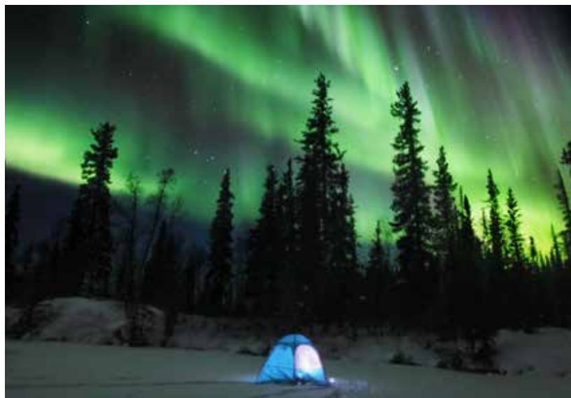
Aurora over a tent, Vee Lake, Yellowknife, Northwest Territories, Canada (-40 Fahrenheit)