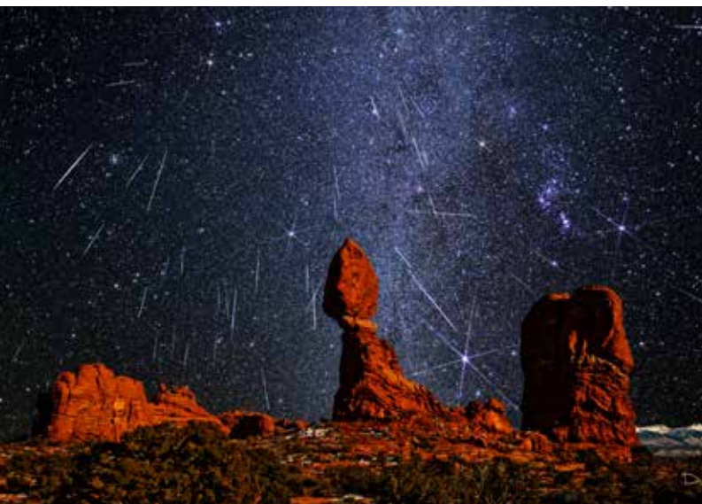
Geminid Meteor Shower over Balanced Rock in Arches National Park, Utah (five-hour composite)