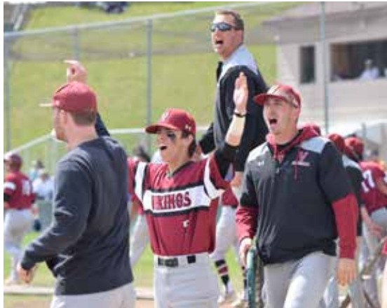
Vikings celebrate a home run during the NSAA tournament.