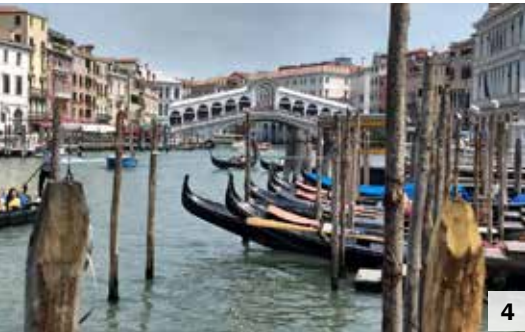
1. Group pose in St. Peter's Square, Rome. 2. On the Spanish Steps, Rome. 3. The Leaning Tower of Pisa. 4. Venice. 5. The Pantheon, Rome. 6. Performing in Santa Maria Maddalena Church, Cremona.