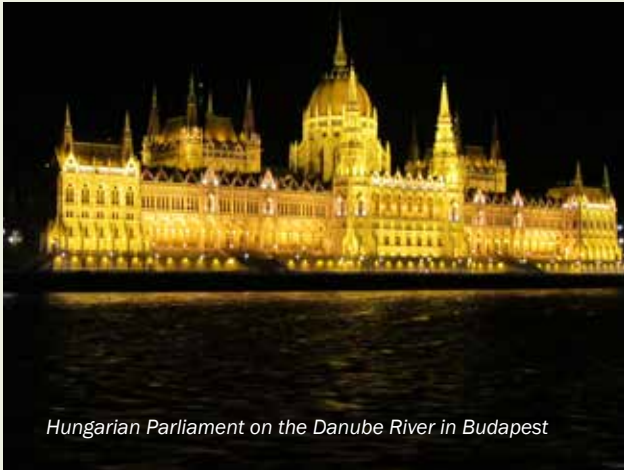
Hungarian Parliament on the Danube River in Budapest